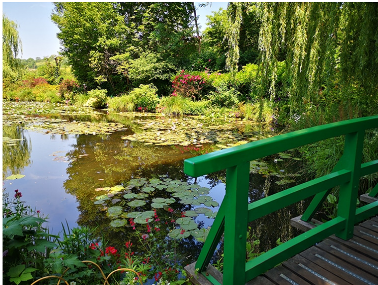
Modern Giverny, preserved as Monet left it.

Renoir, Degas, and Rodin are among the other luminaries in the film.