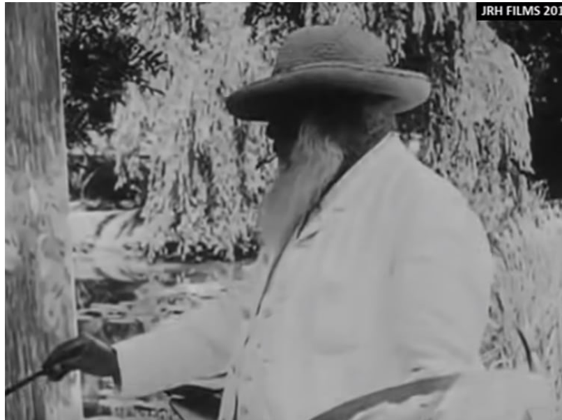
Screenshot from "Ceux de Chez Nous (Those of Our Land)" in 1915.