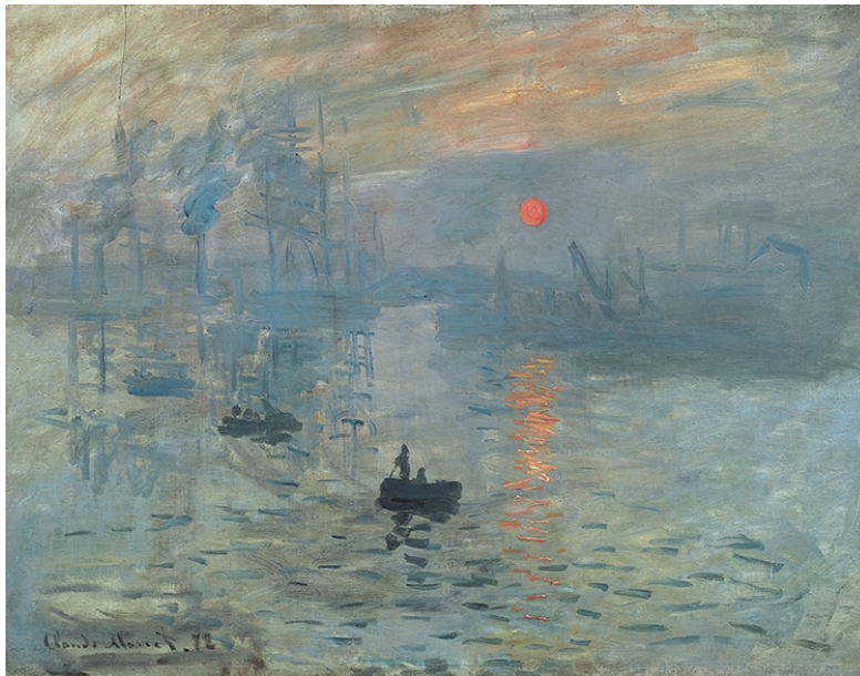
"Impression, Sunrise," by Claude Monet, 1872.

Monet, who died in 1926, was a vanguard of the Impressionist movement.