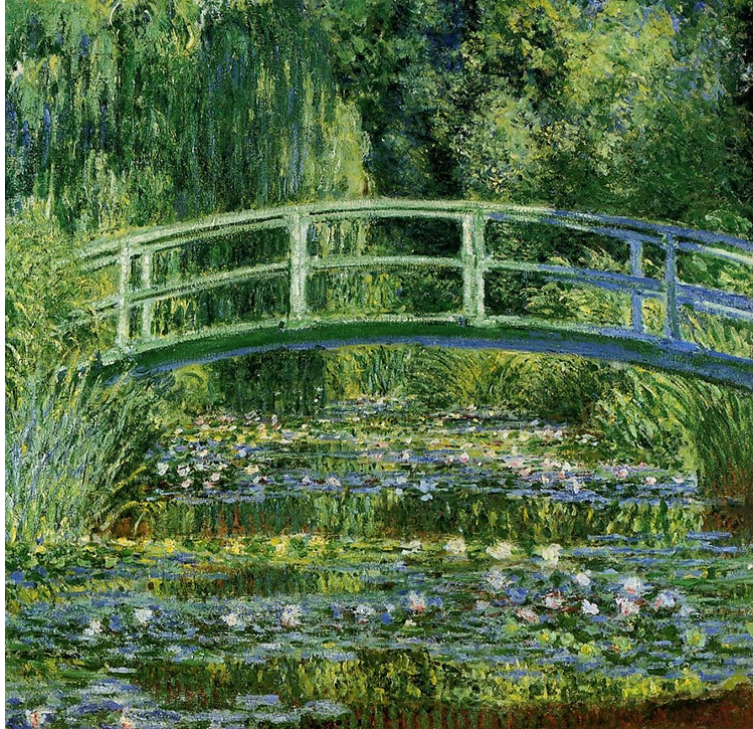
"Water Lilies and Japanese Bridge," by Claude Monet, between 1897 and 1899.

Renoir, Degas, and Rodin are among the other luminaries in the film.